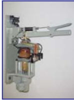
Brake Air Valves