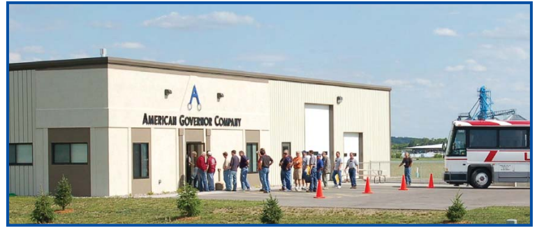
Wisconsin Training and Repair Facility

American Governor has a wide variety of governor assemblies and auxiliary systems that can be sent out on short notice to get your unit running.