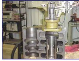
Distributing Valve Plungers & Bushings