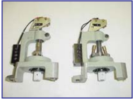
Aux. Speed Switches