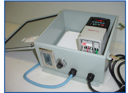
Portable Ballhead Drive Simulator

American Governor Company offers a complete line of pre-engineered retrofit kits, partial upgrade kits, and digital governor systems: