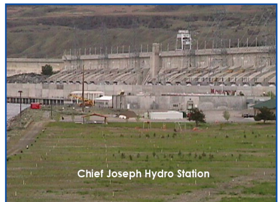
Chief Joseph Hydro Station

LEADING HYDRO UTILITIES THROUGHOUT NORTH AMERICA RELY ON AMERICAN GOVERNOR FOR: