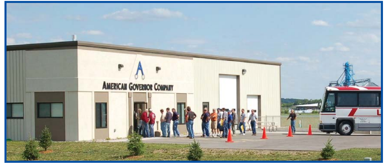
Wisconsin Training and Repair Facility

American Governor has a wide variety of governor assemblies and auxiliary systems that can be sent out on short notice to get your unit running.